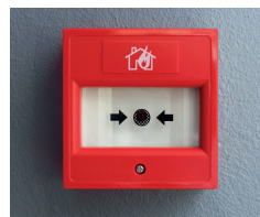
Fire alarm call point