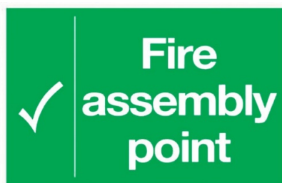
Fire assembly point sign