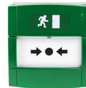
Green emergency release button