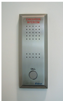
Windcrest refuge and lift communications intercom