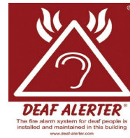
Deaf Alert sign