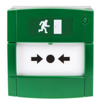
Green emergency door release