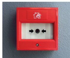
Fire alarm call point