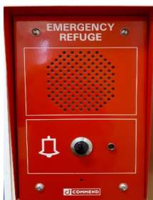
Commend refuge communications intercom