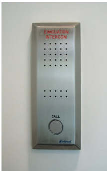
Windcrest refuge and lift communications intercom