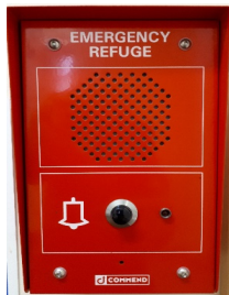
Commend refuge communications intercom