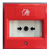
Fire alarm call point