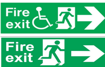
Fire exit sign and wheelchair-friendly fire exit route sign