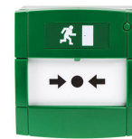
Green emergency door release button