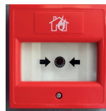
Fire alarm call point