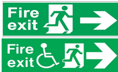
Fire exit sign and wheelchair-friendly fire exit route sign