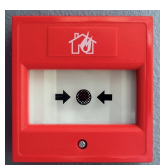
Fire alarm call point