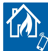
Digital messaging system