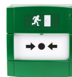
Green emergency door release